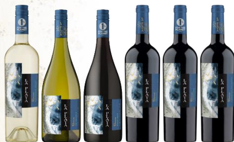
Grand Reserva 6x 750 ml