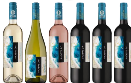
Estate Series 6x 750 ml